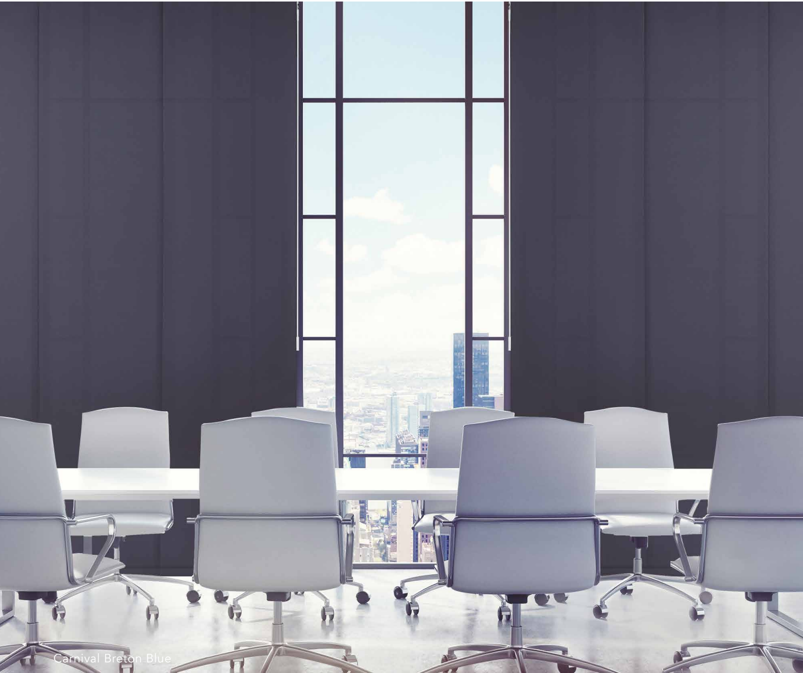
Carnival Breton Blue