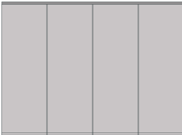
4 Track Channel Front View

Control Wand 1m Code: J4046 1.5m Code: J4047